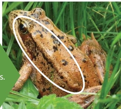
Skin ridges down back