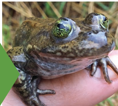
Eyes facing upwards