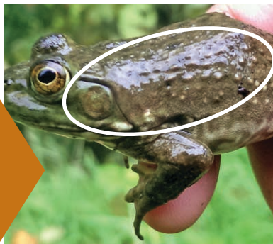
Ear drum & no skin ridges