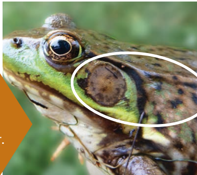
Ear drum & skin ridges