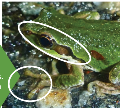
Toepads and eye mask