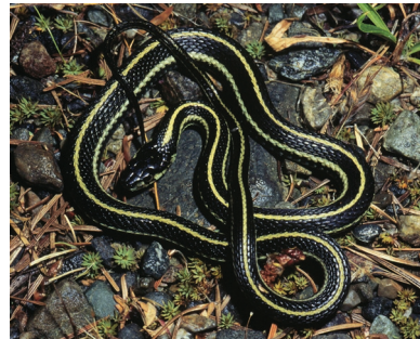
Common Garter Snake