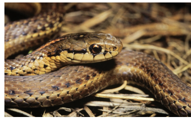
Northwestern Garter Snake

HABITS Often seen out in the open either sunning itself or moving through the undergrowth; shelters under rocks, decaying wood, and debris.