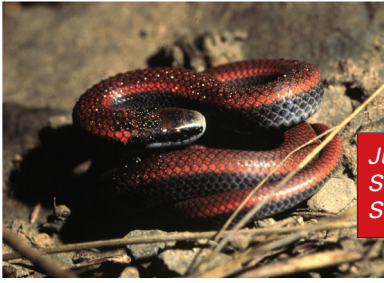
Juvenile Sharp-tailed Snake

HABITS Usually hides under rocks, decaying wood, or debris; seldom seen out in the open.