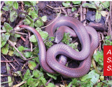
Adult Sharp-tailed Snake