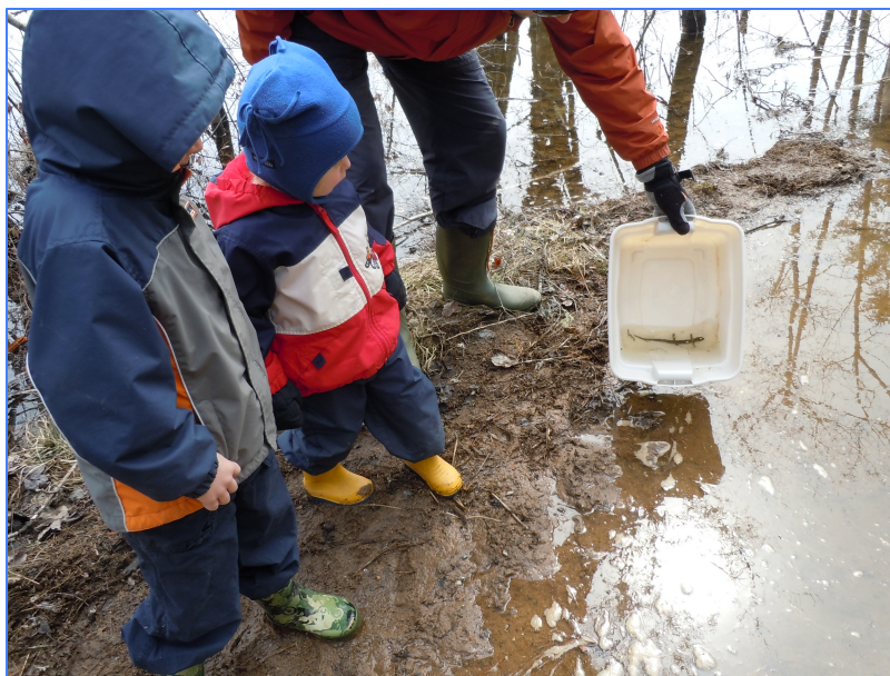
Figure 4. Spring time in the Annapolis valley, Nova Scotia. Children explore a wetland where spotted salamanders, Ambystoma maculatum , lay their eggs every year.

Salamanders have an important role in environmental conservation and natural history education. The past year, 2014, was designated as The Year of the Salamander by two of the most influential amphibian conservation groups in North America: the Amphibian and Reptile Conservation ( PARC ) and the Amphibian Survival Alliance (ASA, www.amphibians.org ). The partnership between PARC and ASA resulted in a combined effort to offer materials online for educators and naturalists to raise awareness regarding the importance of salamanders in the natural world. Given their benign nature, small size and bright coloration, salamanders are ideal subjects to introduce children to the natural world and promote the importance of conservation.