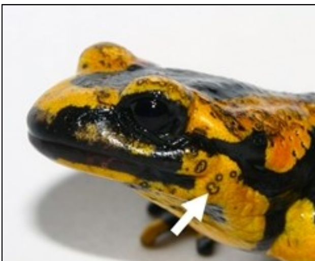
Fire salamander with lesions on its face.