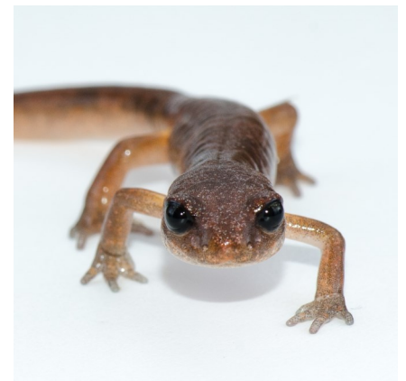
Top border photos courtesy of Crowley (2016): Northern Two-lined Salamander, Spotted Salamander, Red-spotted Newt, Blue-spotted Salamander, Northern Dusky Salamander, Eastern Red-backed Salamander, Four-toed Salamander, Northern Long-toed Salamander, Red-spotted Newt (aquatic). Bottom photo courtesy of Ovaska (2016).