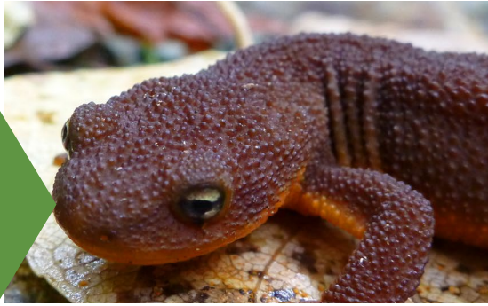
Thick, bumpy skin