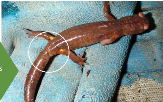
Pinched base of tail