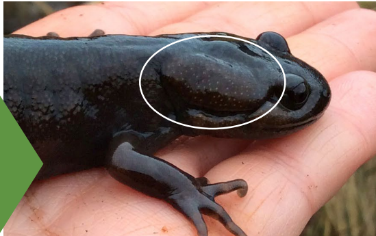
Large glands behind the eyes